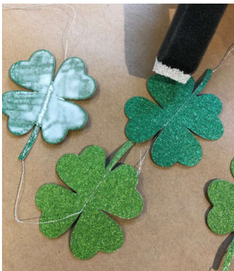
Applying Size over coated paper