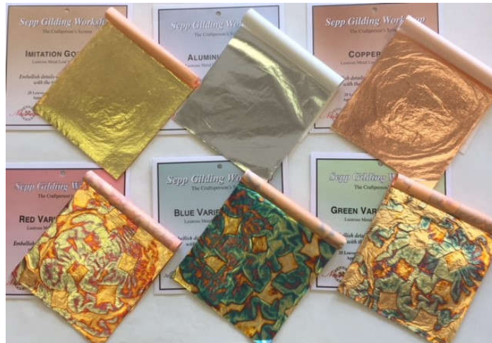
Sepp Gilding Workshop Leaf – Imitation Gold, Aluminum, Copper, and Red, Blue and Green Variegated