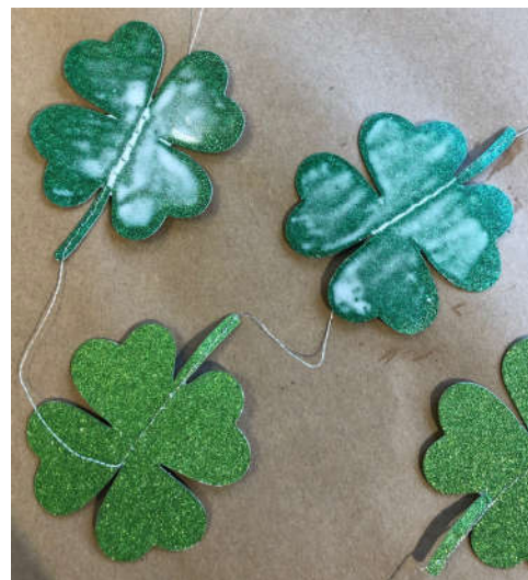
The Size begins to turn clear

Load your foam brush with Gilding Size and lightly coat one side of each shamrock you want to gild.