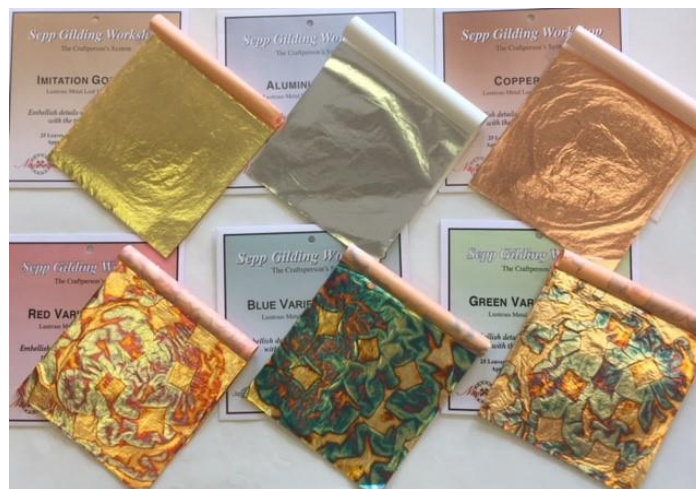
Sepp Gilding Workshop Leaf – Imitation Gold, Aluminum, Copper, and Red, Blue and Green Variegated

Sepp Gilding Workshop (SGW) also offers Gilding Kits with varying colors of leaf and primers, along with size, brush, stir stick and even gloves. SGW also offers Red, Yellow and Gray primers, and Imitation Gold, Aluminum, Variegated Red, Blue and Green Leaf separately.