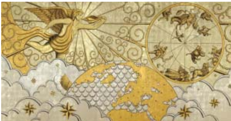
"Aurora Borealis," one of several verre églomisé murals created by Christianson Lee Studios and installed on the Queen Mary 2, measures 10x5½ ft. The Ridgefield, CT, company won a 2005 Sepp Leaf award in the Verre Églomisé category.