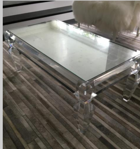
Gilded by Charles Douglas Gilding Studio, Seattle, WA; Fabricated by New Dimensions, Bellevue WA;

The gilding was abraded by hand with cotton with a little help of pumice. Great care needs to be taken when rubbing glass gilding with such an abrasive, making sure that the gold does not come off too aggressively. The appearance of the abrasion tends to look best though when simply hand-rubbed with a