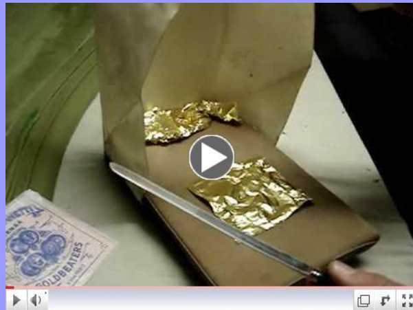
Gilding: Using the Gilder's Pad ~ Charles Douglas Gilding Studio