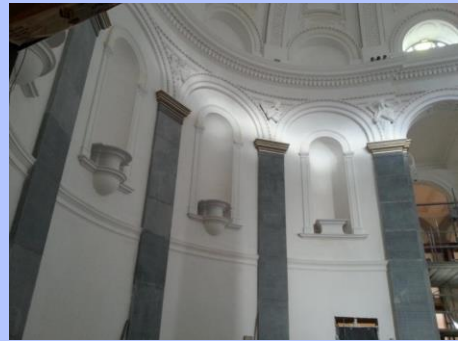
St. Mels Cathedral in Longford, Ireland