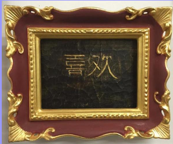
Crackled gesso with 23k water gilded Pastiglia (raised gesso) on Canvas